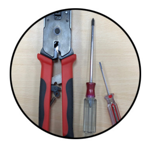
STEP 1 Tools Required: Phillips screwdriver Flat head screwdriver

Part Numbers: DT-RJ45-RPLBLADES and DT-RJ45-CRIMPTOOL