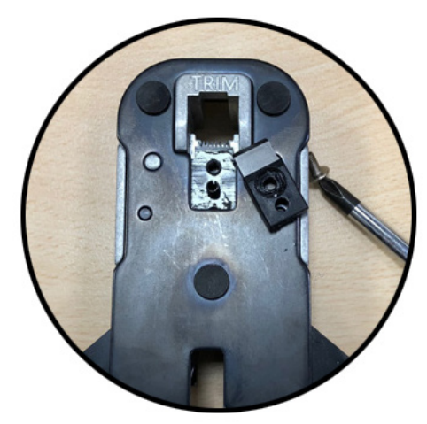
STEP 6 Place the new blade onto the crimper, and use the Phillips screwdriver to tighten it.