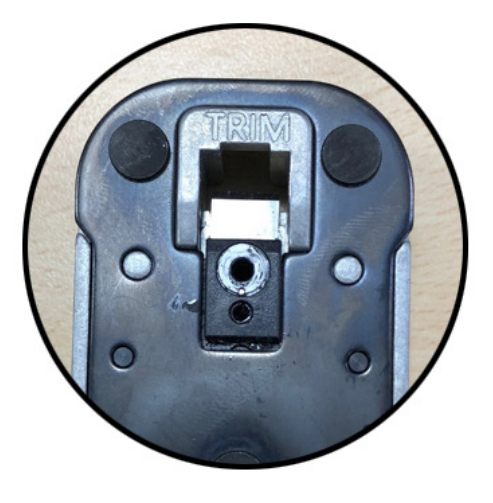
STEP 3 Take off the screw, and put it aside.