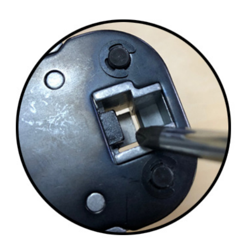
STEP 4 Turn to the other side of the tool, take the tool up, and use the front end of the screwdriver to knock the trimming blade a couple times, so the trimming blade could come off the tool a little bit.