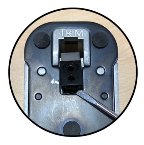
STEP 5 Turn to the original side of the tool, use the flathead screwdriver to force the trimming blade to come off completely.